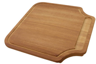
Iroko-wood chopping board 8646 000