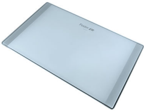
Glass chopping board 8633 300