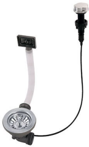
Automatic waste fitting 8407 100